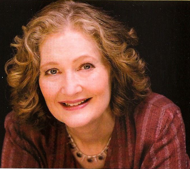
Emma Kirkby: deep-set musical intelligence